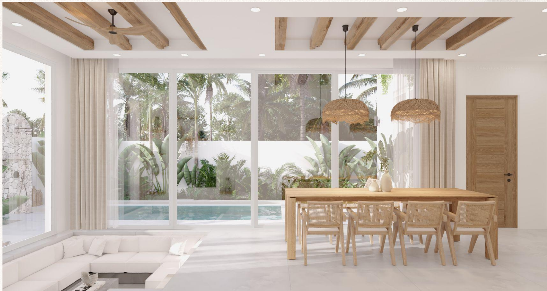
Gili 3 Bedroom

Renderings are preliminary and may change without notice. Loose furniture and equipment are not included. For more information about the project and villa specifications, please contact your representative.