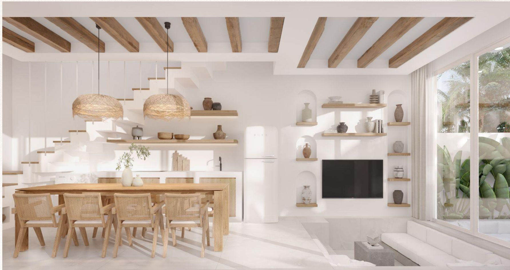
Gili 3 Bedroom

Renderings are preliminary and may change without notice. Loose furniture and equipment are not included. For more information about the project and villa specifications, please contact your representative.