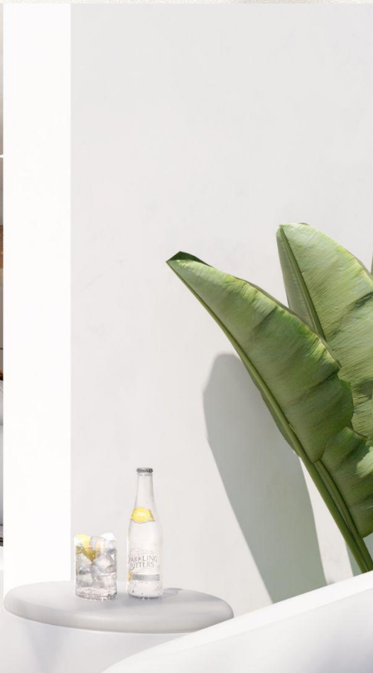
Nova 3 Bedroom

Renderings are preliminary and may change without notice. Loose furniture and equipment are not included. For more information about the project and villa specifications, please contact your representative.