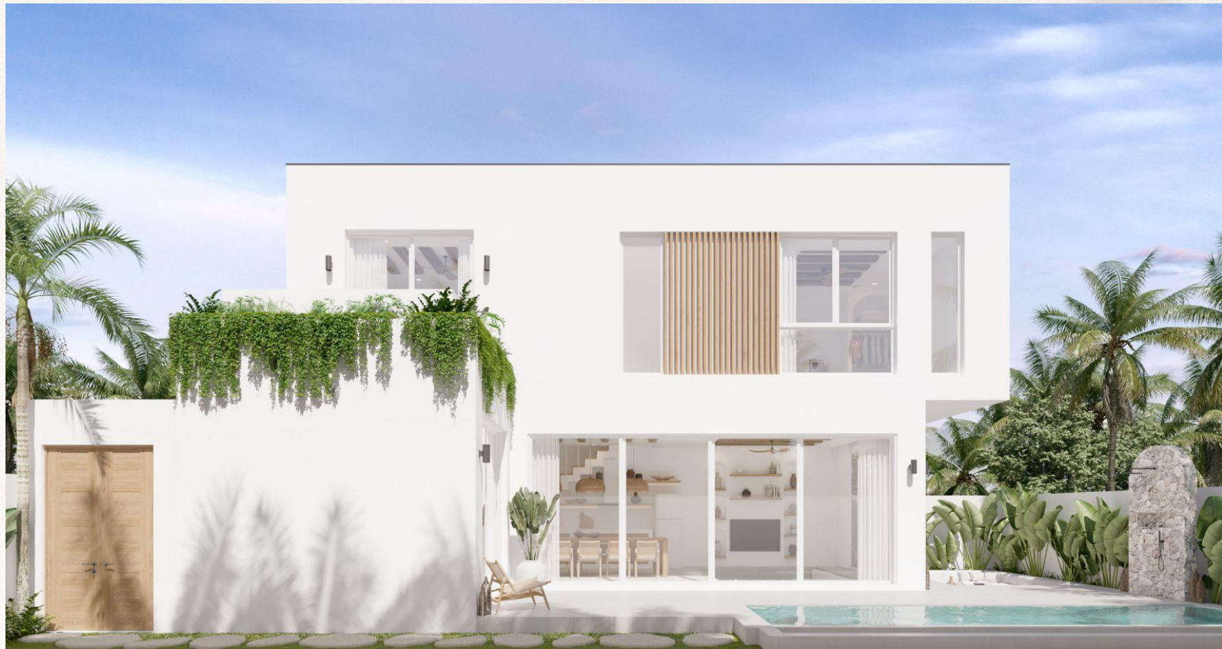
Gili Max 3 Bedroom

Renderings are preliminary and may change without notice. Loose furniture and equipment are not included. For more information about the project and villa specifications, please contact your representative.