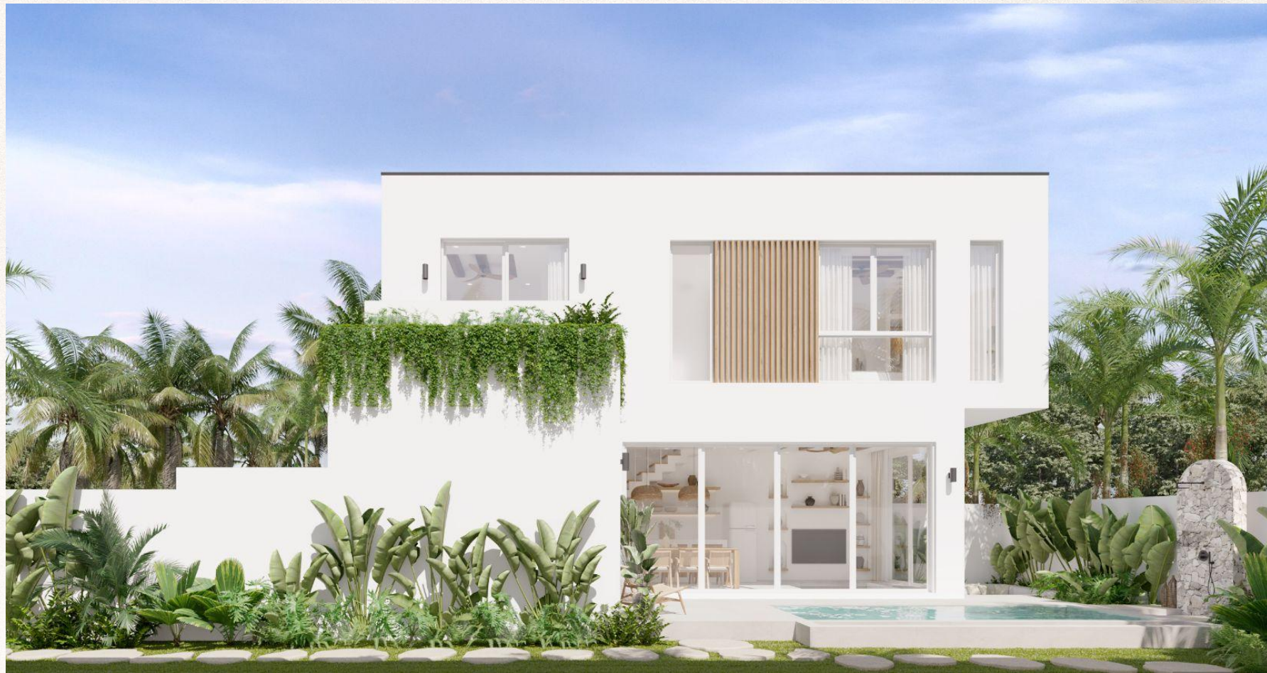
Gili 3 Bedroom

Renderings are preliminary and may change without notice. Loose furniture and equipment are not included. For more information about the project and villa specifications, please contact your representative.