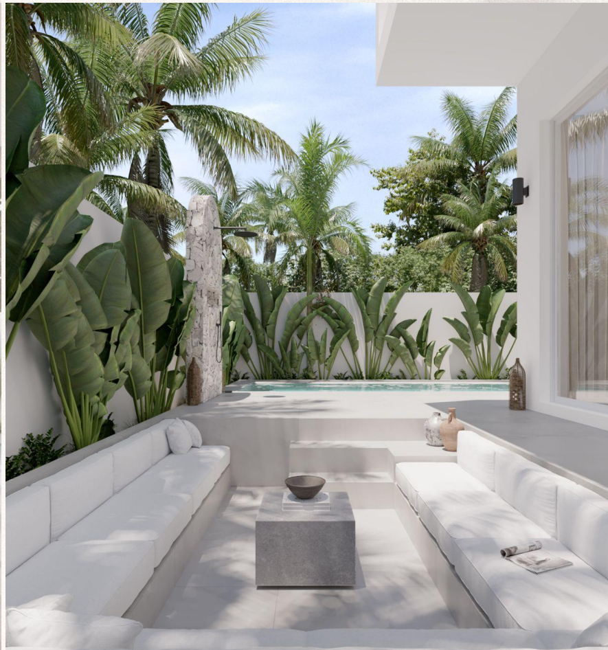
Gili Max 3 Bedroom

Renderings are preliminary and may change without notice. Loose furniture and equipment are not included. For more information about the project and villa specifications, please contact your representative.