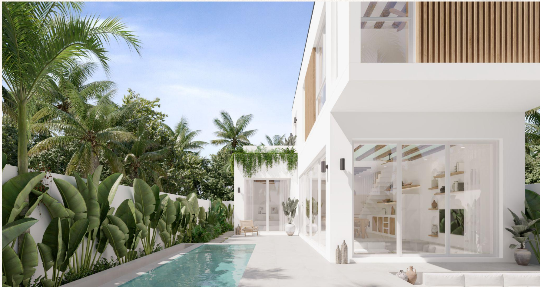
Gili Max 3 Bedroom

Renderings are preliminary and may change without notice. Loose furniture and equipment are not included. For more information about the project and villa specifications, please contact your representative.