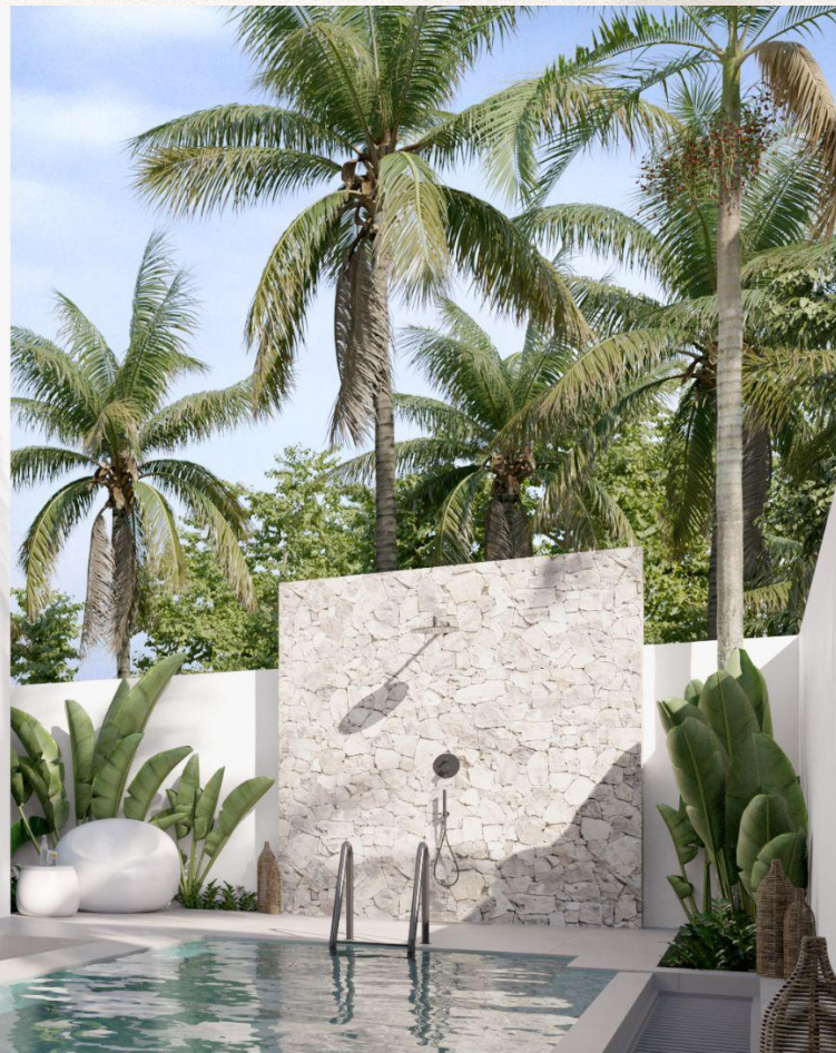
Nova 3 Bedroom

Renderings are preliminary and may change without notice. Loose furniture and equipment are not included. For more information about the project and villa specifications, please contact your representative.