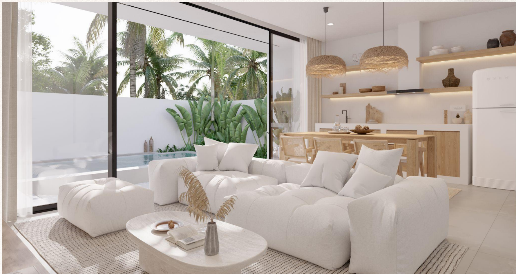
Nova 3 Bedroom

Renderings are preliminary and may change without notice. Loose furniture and equipment are not included. For more information about the project and villa specifications, please contact your representative.