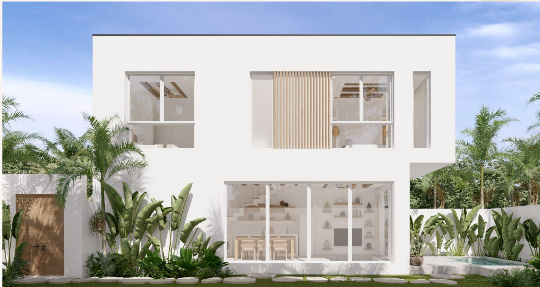
Gili 2 Bedroom

Renderings are preliminary and may change without notice. Loose furniture and equipment are not included. For more information about the project and villa specifications, please contact your representative.