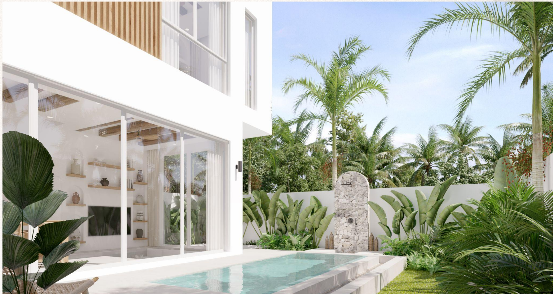
Gili 3 Bedroom

Renderings are preliminary and may change without notice. Loose furniture and equipment are not included. For more information about the project and villa specifications, please contact your representative.