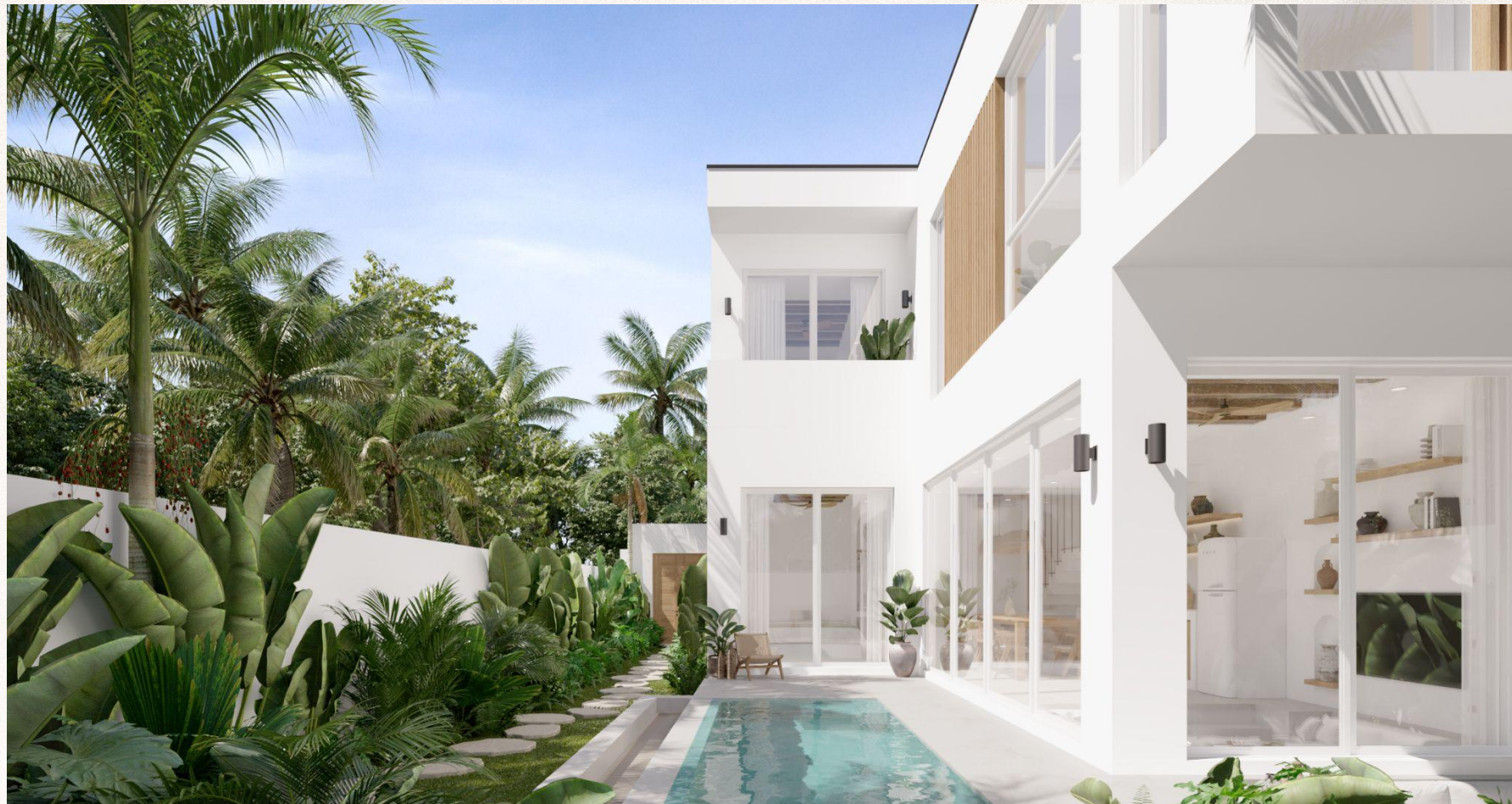
Gili 4 Bedroom

Renderings are preliminary and may change without notice. Loose furniture and equipment are not included. For more information about the project and villa specifications, please contact your representative.