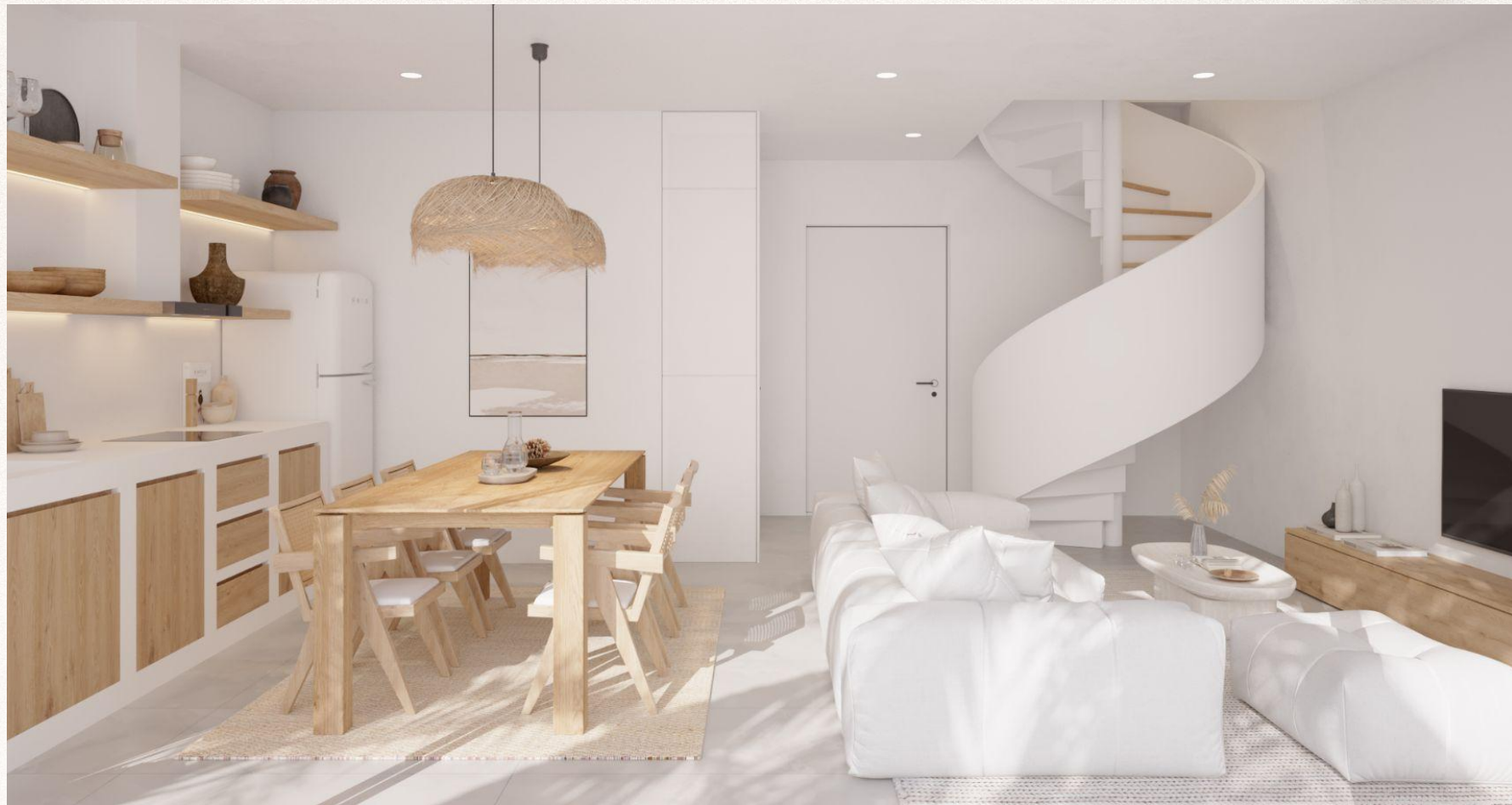
Nova 3 Bedroom

Renderings are preliminary and may change without notice. Loose furniture and equipment are not included. For more information about the project and villa specifications, please contact your representative.