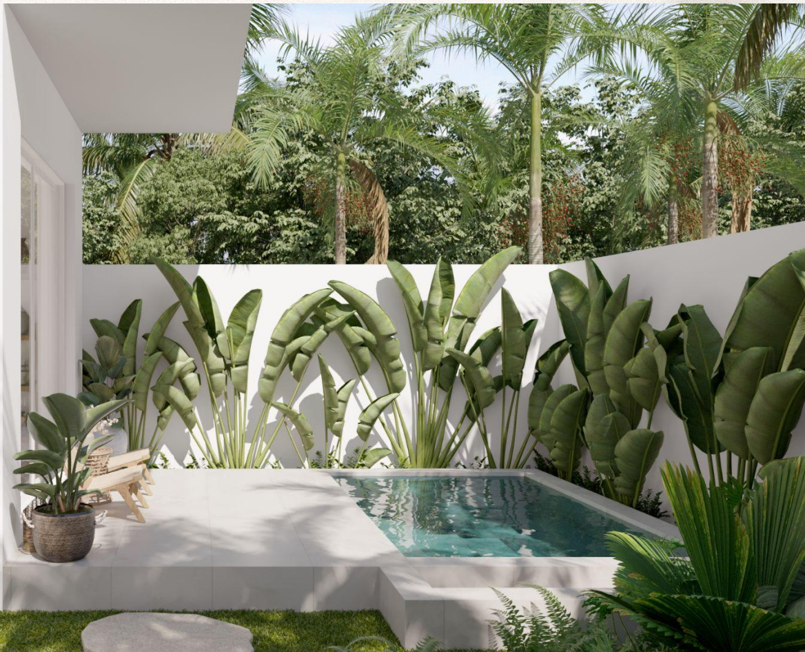
Gili 2 Bedroom

Renderings are preliminary and may change without notice. Loose furniture and equipment are not included. For more information about the project and villa specifications, please contact your representative.