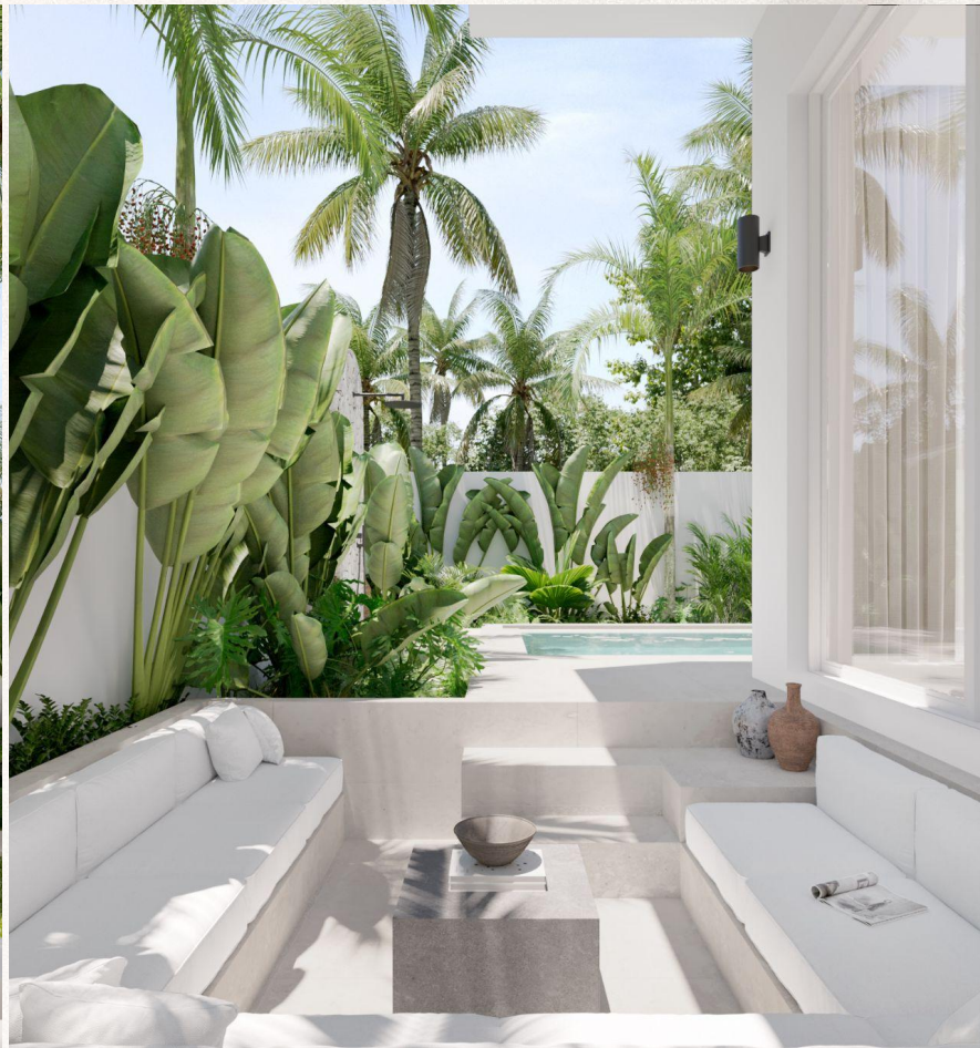
Gili 3 Bedroom

Renderings are preliminary and may change without notice. Loose furniture and equipment are not included. For more information about the project and villa specifications, please contact your representative.