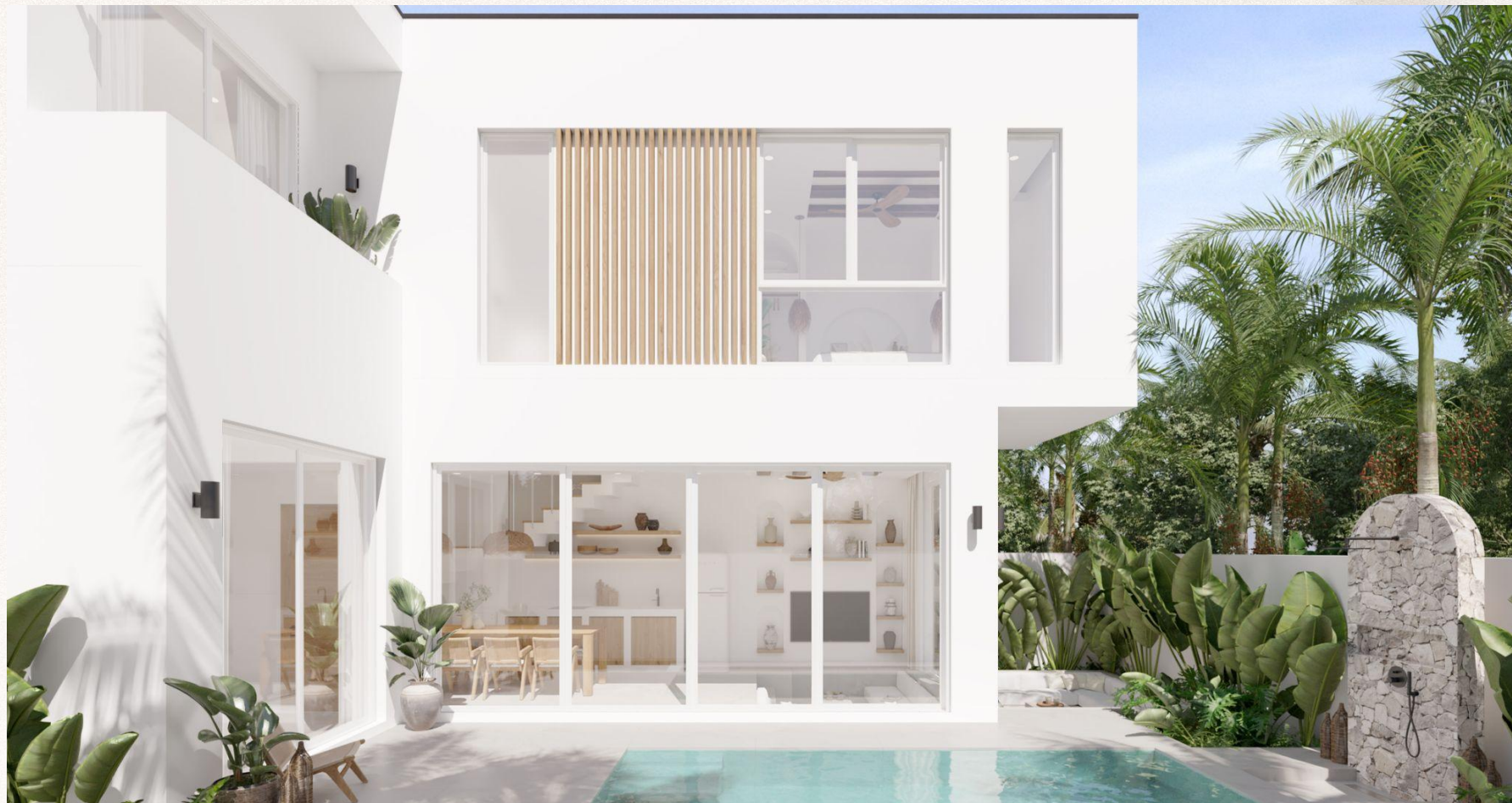
Gili 4 Bedroom

Renderings are preliminary and may change without notice. Loose furniture and equipment are not included. For more information about the project and villa specifications, please contact your representative.