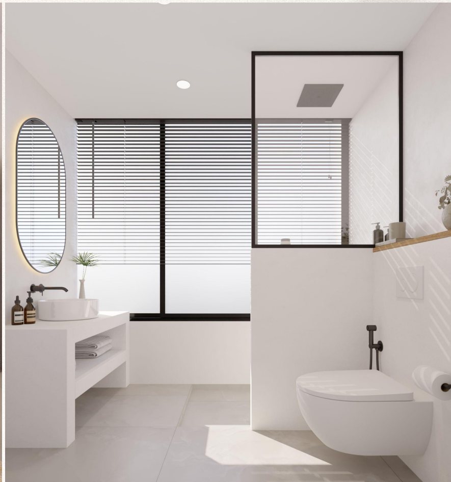
Nova 3 Bedroom

Renderings are preliminary and may change without notice. Loose furniture and equipment are not included. For more information about the project and villa specifications, please contact your representative.