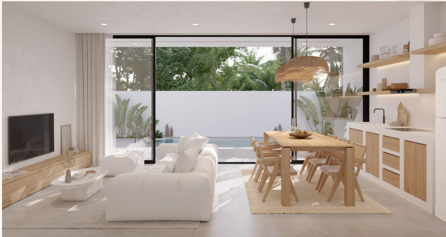
Nova 3 Bedroom

Renderings are preliminary and may change without notice. Loose furniture and equipment are not included. For more information about the project and villa specifications, please contact your representative.