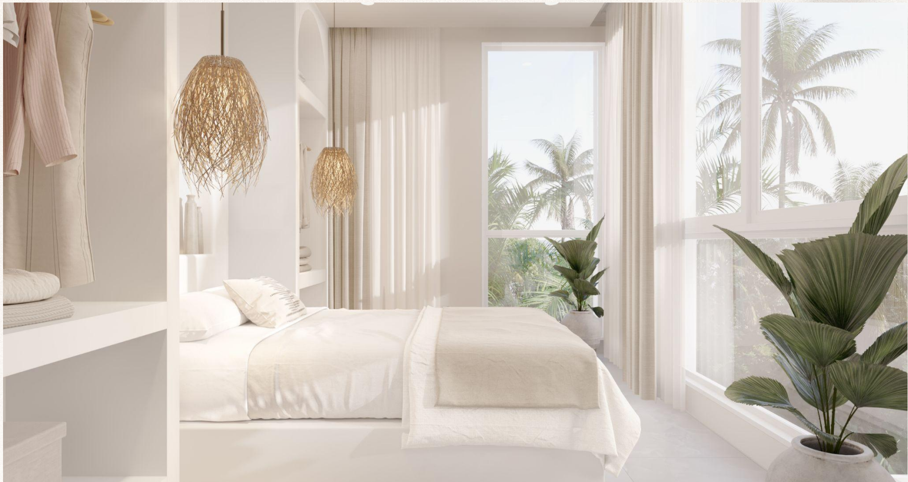
Gili 3 Bedroom

Renderings are preliminary and may change without notice. Loose furniture and equipment are not included. For more information about the project and villa specifications, please contact your representative.