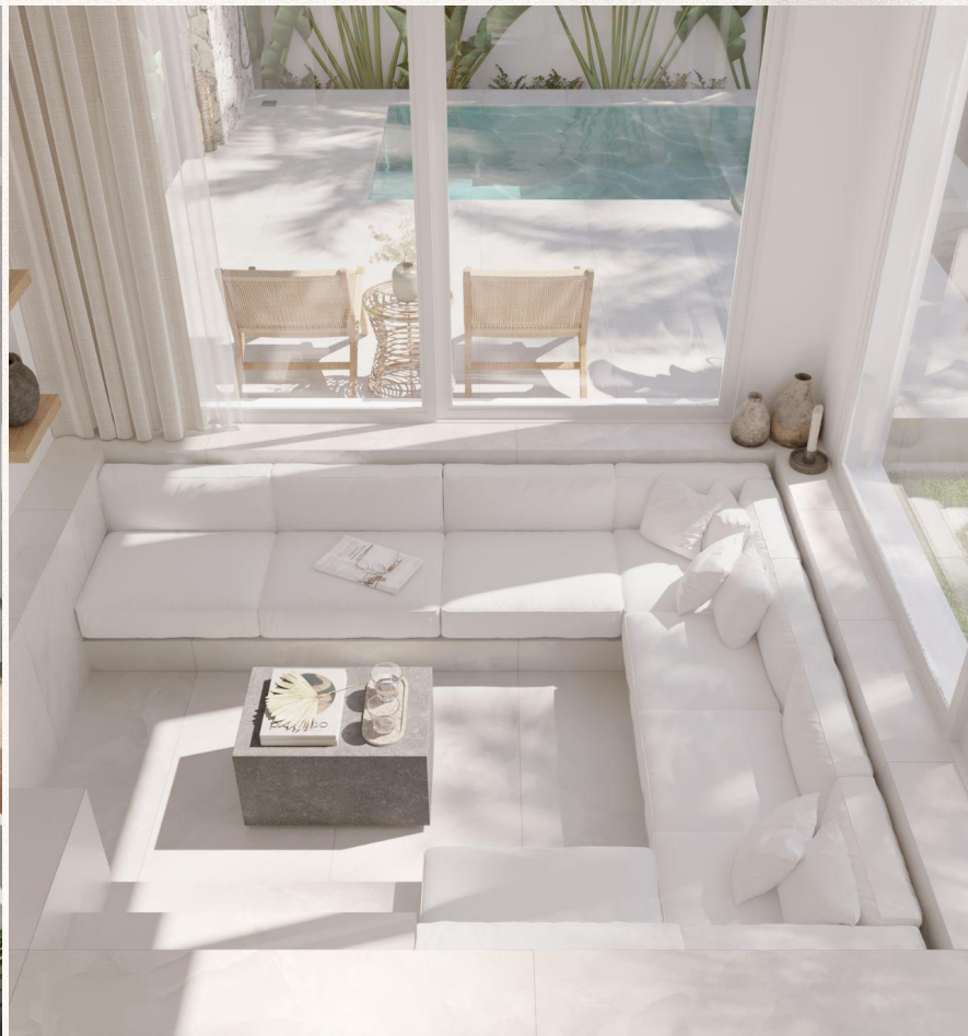
Gili 2 Bedroom

Renderings are preliminary and may change without notice. Loose furniture and equipment are not included. For more information about the project and villa specifications, please contact your representative.