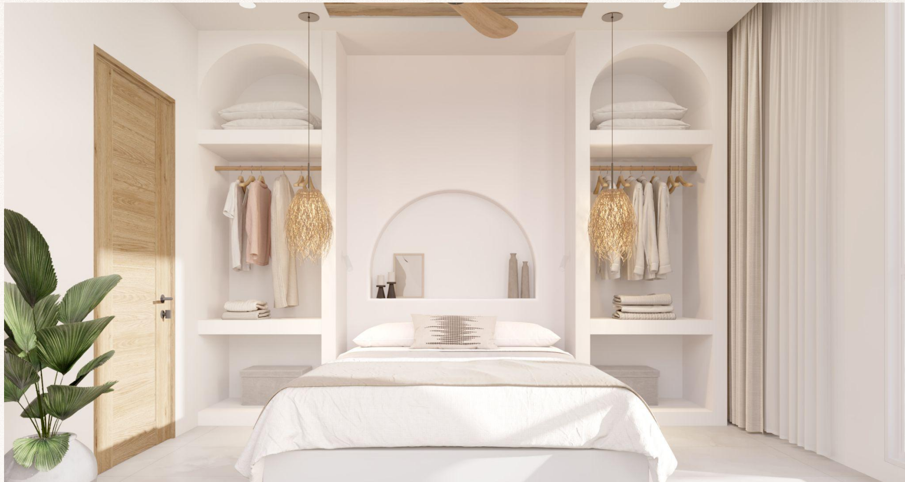
Gili 3 Bedroom

Renderings are preliminary and may change without notice. Loose furniture and equipment are not included. For more information about the project and villa specifications, please contact your representative.